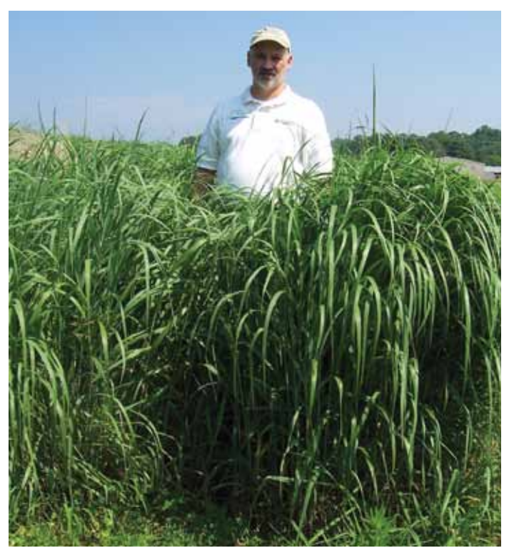
Fig. 2. This 18-year-old stand of cave-in-rock switchgrass continues to produce large volumes of quality forage.

As with any forage, hay quality is strongly influenced by timing of harvest. Harvest of NWSG at late-boot stage will typically produce hay with protein levels of 10 percent or higher. However, like most warm-season forages, NWSG will test at levels below those for coolseason forages harvested at a comparable maturity level. This is partly because proteins in NWSG do not break down as quickly during ruminant digestion and bypass the rumen; thus, they are referred to as "bypass proteins." Because bypass proteins can be absorbed in the intestines, animal performance on NWSG exceeds what we would predict based on forage sample analysis. For example, when grazed, NWSG routinely produce from 1.5 - 2.5 lb of daily gain in steers (Fig 3). Furthermore, NWSG forage quality is not diminished by endophyte fungi, a substantial problem with tall fescue.