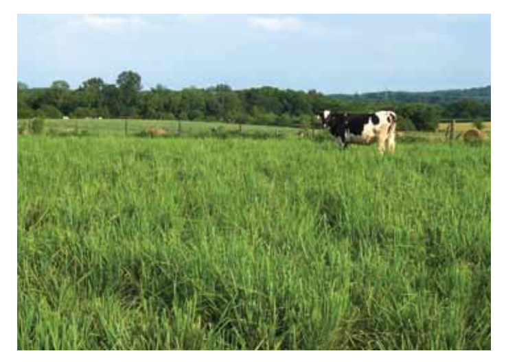
Fig. 9. Native warm-season grasses, such as this mixed stand of big bluestem and indiangrass, provide excellent grazing during the summer and provide a buffer against drought. Bred Holstein heifers (1000 – 1100 lb) gained nearly 1.9 lb per day during 2010, one of the hottest summers on record in Tennessee. Such grasses can provide a strong complement to existing cool-season grass forages.

All of these publications may be accessed online by going to: http://nativegrasses.utk.edu.