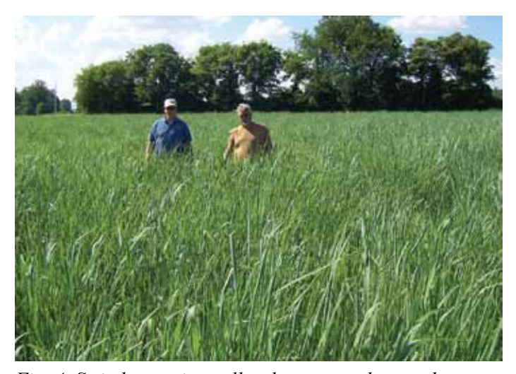
Fig. 4. Switchgrass is a tall, robust grass that produces high yields. Seedheads are open "panicles" typical of the panic grasses and appear during mid- to late-June.

Developed from plant material collected in southern Texas, Alamo is a lowland variety that is currently considered the primary species for biofuel production. At maturity, Alamo commonly reaches heights of 10 feet and can produce substantial amounts of forage. Like