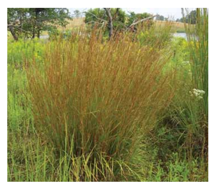
Fig. 6. A mature clump of little bluestem, a smaller bunch grass that often shows a reddish hue on its stems. Note the mature big bluestem plant in the background on the right. Despite its smaller size, little bluestem can produce desirable forages – even on poor ground.

A more recent release, OZ-70 was developed from plant material collected from a number of locations in the Mid-South. As such, it is one of the first varieties of big bluestem from this region. Like other varieties of big bluestem, it has wide site adaptation, but will not tolerate flooding as well as switchgrass.