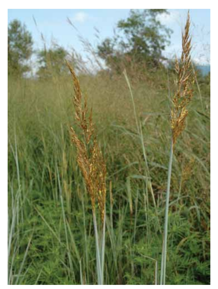
Fig. 7. Indiangrass is easily recognizable by the blueish hue of its stems and the large yellow seedheads. Indiangrass is the latest of the NWSG to produce seedheads; typically they appear in July and August.

Probably the most widely used variety in the Mid-South, Rumsey was developed from plant material from south-central Illinois. It produced yields similar to Cheyenne in variety trials conducted by the University of Kentucky.