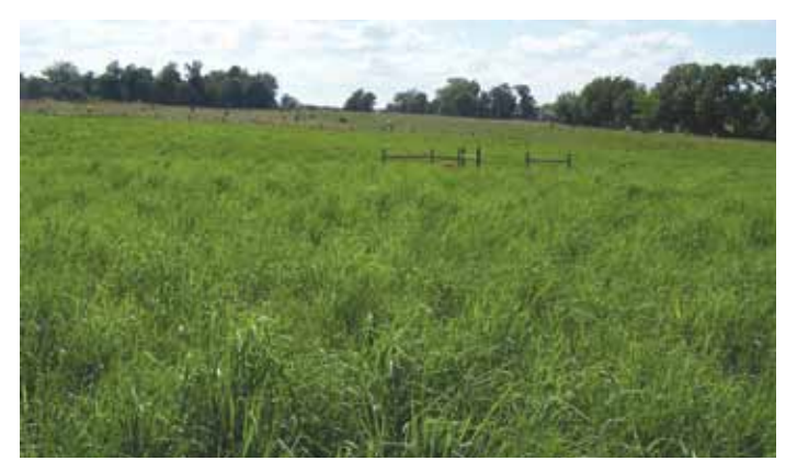
Fig. 5. Big bluestem is a fine-leaved species that produces good yields of excellent forage. Seedheads are produced in June and July and are easily recognized by their "turkey-foot" appearance.

easier to manage. It tends to mature somewhat later than switchgrass. There are many varieties of big bluestem available, but here we consider only two.