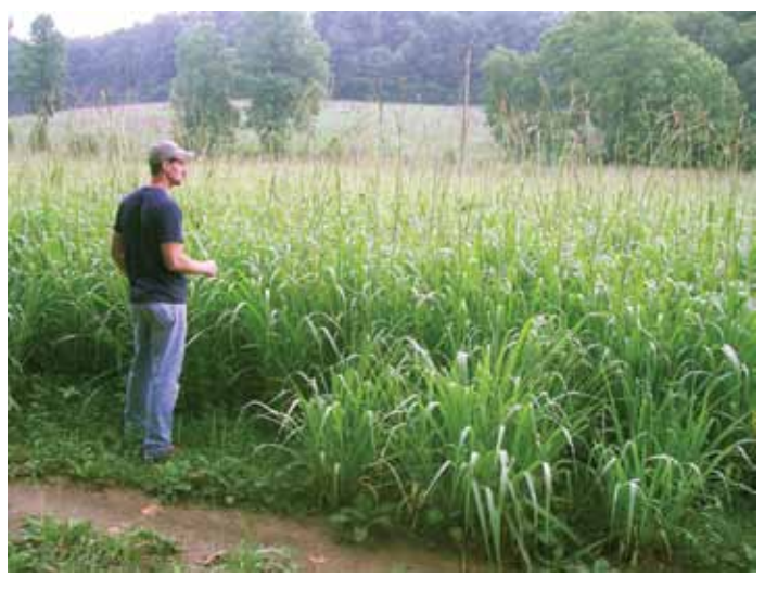
Fig. 8. Eastern gamagrass produces impressive yields of quality forage. Its seedheads appear in June and are quite distinctive.

Like switchgrass, eastern gamagrass produces very high yields and tolerates wet sites (Fig 8). It begins spring growth sooner than the other NWSG and also maintains growth later in the season than the other species – with the exception of indiangrass. It can support high stocking rates due to its high productivity.