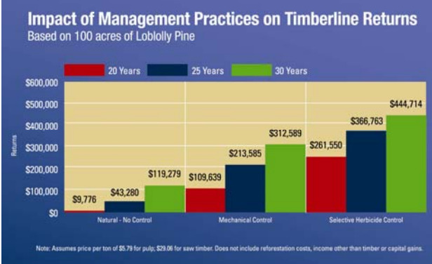
Source: Adapted from: Yin and Sedjo, Journal of Forestry, Dec. 2001

Monroe added, "Studies show by using a consultant forester, the landowner typically nets anywhere from 20 to 40 percent more for their timber than what they'd get on their own."