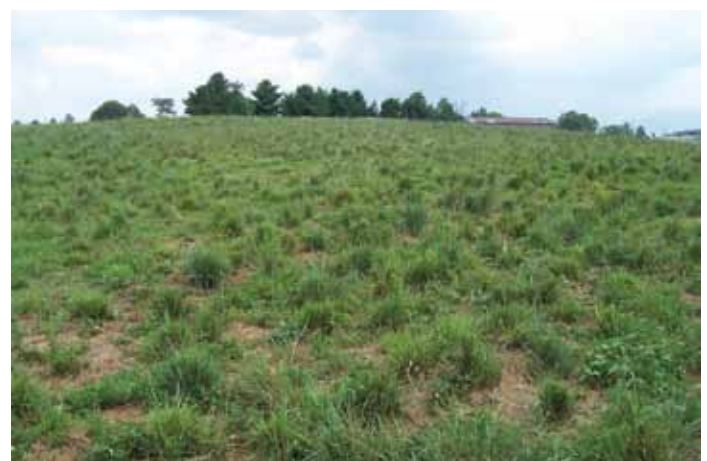
Fig. 7. Grazing below 12 inches weakens NWSG and allows weed encroachment.

Because all of these grasses are tall-growing, they have few leaves close to the ground and growing points much higher above ground than many of the other forage species grown in this region. Consequently, they are more prone to overgrazing and should not be grazed closer than about 12 inches tall. If they are grazed below this height,