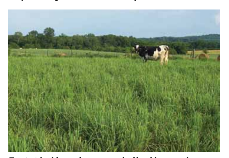
Fig 4. A highly productive stand of big bluestem during an unusually hot summer is providing excellent forage. Attention to detail lead to this successful third-year stand.

By the second year (12 months post-planting), your NWSG will be well-established, but not mature. Regardless, they will be quite competitive with most weeds. There are a few situations though, that may bear some attention. If the first-year stand was slow-developing, weeds may have become well-established. Most annuals will not be an issue during year two. But other weeds, especially johnsongrass and broadleaves, should be sprayed during the spring. For bluestems and indiangrass, heavier rates of imazapic (up to 3 oz active ingredient/ac) can be used to control many of these weeds. For switchgrass, nicosulfuron + metsulfuron (Pastora ®) applied at 1.0 oz/ac of product provides good control. Also, any number of broadleaf-