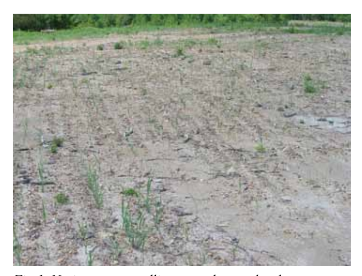
Fig 1. Native grass seedlings are slow to develop. However, on this clean, firm, conventionally prepared seedbed, these small seedlings will develop into a goodquality forage stand.

Broomsedge, johnsongrass and dallisgrass can all compete aggressively with NWSG. Where any of these are an issue, plan to spray during August the year BEFORE planting. For johnsongrass or broomsedge, 1-2 qt/ac (for 4 lb active ingredient/gal formulations) glyphosate will be adequate, but for dallisgrass or bermudagrass (see sidebar, "Controling bermudagrass"), rates of up to 5 qt/ac will be