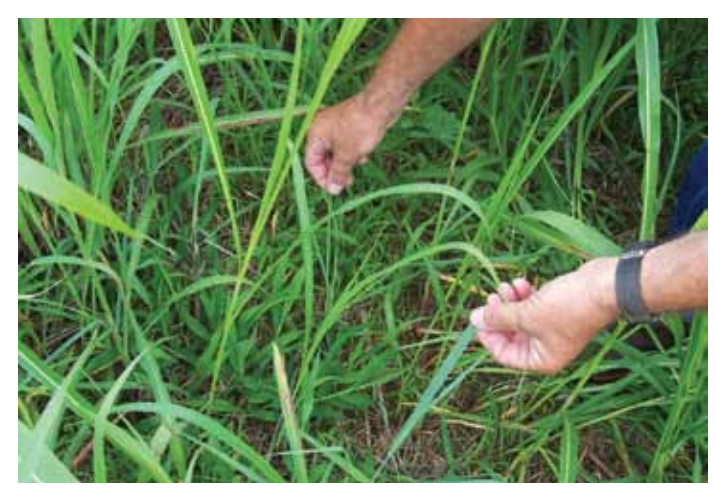
Fig 3. Even though large switchgrass seedlings (being held in each hand, above) have developed as a result of this planting, the weed canopy was allowed to overtop the seedlings. When this occurs, there is little chance of a successful stand. These weeds MUST be controlled in a timely manner.

With a seedling stand of acceptable density, your remaining challenge during the summer is to ensure seedlings have reasonable relief from weed pressure. The key is to not allow weeds to form a canopy above the seedlings (Fig. 3). A few scattered weeds are not much of a concern. Dense stands of johnsongrass, signalgrass, crabgrass or broadleaf weeds, on the other hand, can be a serious problem and can easily result in the loss of the stand. The best way to handle this is to regularly inspect your field in the weeks following planting. Be prepared to either clip or spray weeds as needed. Timeliness is critical. Some herbicides that control broadleaf weeds can damage smaller grass seedlings. When clipping, be sure to keep your mower above the developing seedlings. You may be