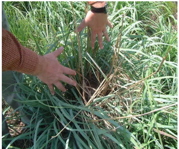
Birds typically nest in the center of NWSG clumps as pictured.

Nesting density of all birds in 30' wide NWSG and legume buffers were found to be 6 times greater than in field edges without buffers. Nesting density of all birds in buffers between 30' and 99' were 38 times greater.