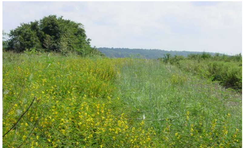
Partridge Pea and NWSG mixture.

Riparian buffers and grass filter strips have been proven to reduce sedimentation and other non-point source agricultural pollutants throughout the country. Standard practices have included the establishment of Bermuda grass, fescue, switchgrass, and other plant materials. While these plant materials do provide significant water quality benefits, they do not provide significant wildlife benefits. Other plant materials can be used to effectively reduce sediment and non-point source agricultural pollutants while also providing significant habitat for the Northern bobwhite quail and other grassland songbird species. The most beneficial suite of plant materials includes a mixture of native warm season grasses (NWSG) and legumes.