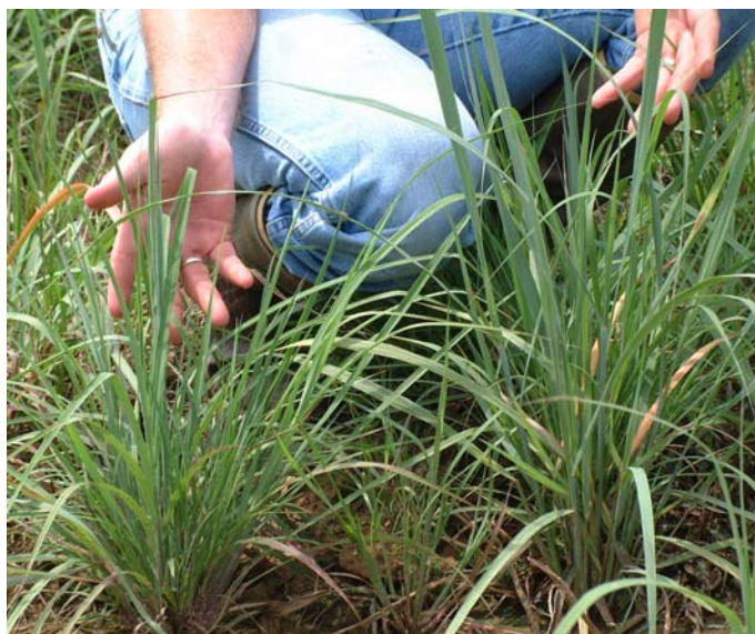
1st year growth under optimum conditions

Under optimum conditions, NWSG germination will take approximately 12 weeks. Under normal conditions, it may take up to three years before ALL NWSG seeds germinate. Legumes should germinate and grow well during the first growing season. After germination, NWSG seedlings will grow slowly until first frost. Seedlings rarely reach a height of 36 inches in the first year. During the second growing season, these seedlings should reach a height of 4 - 5 feet. After three growing seasons, NWSGs general reach maturity and a maximum height of 5 - 7 feet.