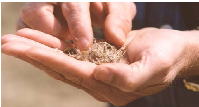
Fluffy NWSG Seed

NWSG seeds are "fluffy" and cannot be planted with standard drills or grass seeders. A special fluffy seed drill must be used to plant NWSGs.