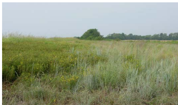
Three year-old site.

A mixture of Little Bluestem, Big Bluestem, Indiangrass, Partridge Pea, and Kobe Lespedeza may be the most widely accepted mixture and can be used with success throughout most Southern and Midwestern States. Variety selection is still important whereas some varieties do better in different parts of the country.