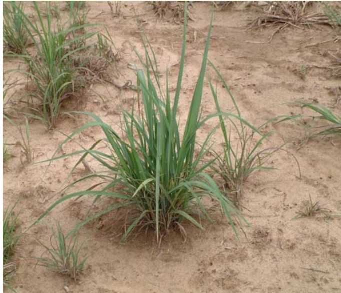
Plateau® application reduces native weed competition

To further aid NWSGs and legumes during their initial establishment, post-emergent herbicide applications of imazapic (Plateau®) can be used. A rate of 4 - 8 oz./acre should be used. Higher rates are recommended on sites with intense native weed competition.