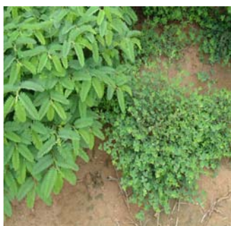
Partridge Pea and Kobe Lespedeza

While NWSGs do provide a significant erosion control function, it may be advisable to add switchgrass to the listed mixture on sites with a slope greater than 5%. Switchgrass should also be used on sites where erosion is excessive.