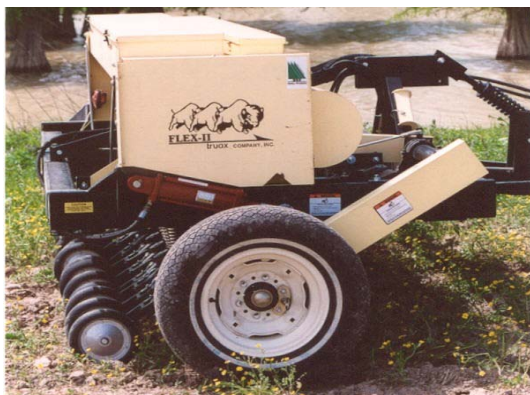
Specialty planter for fluffy seed.

NWSG planting may begin in February in most Southern states and late March in Midwestern states. A late frost or snow will not harm NWSG seed after planting. 1st year germination should not be expected if NWSGs are planted after