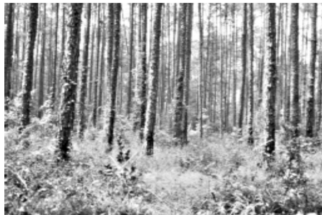
Figure 3. An unthinned pine plantation (above left) can shade out understory vegetation, reducing food and cover for wildlife. Thinning allows sunlight to reach the forest floor, which promotes the growth of understory shrubs and herbs valuable to many animals (above right).