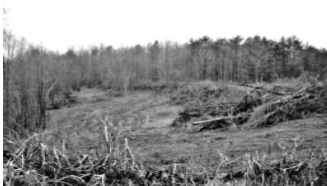
Figure 2. Windrows (below) and brushpiles provide food and cover for a variety of wildlife species.