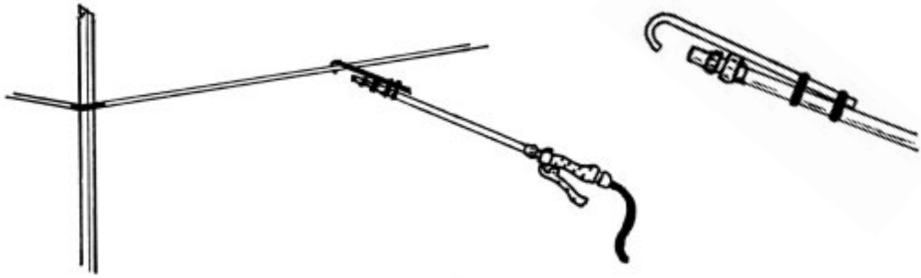
Figure 2. A hook attached to the sprayer nozzle aids in directing the repellent onto the fence.