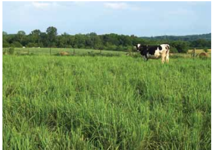
Fig. 9. Native warm-season grasses, such as this mixed stand of big bluestem and indiangrass, provide excellent grazing during the summer and provide a buffer against drought. Bred Holstein heifers (1000 – 1100 lb) gained nearly 1.9 lb per day during 2010, one of the hottest summers on record in Tennessee. Such grasses can provide a strong complement to existing cool-season grass forages.

All of these publications may be accessed online by going to: http://nativegrasses.utk.edu .